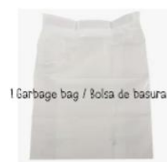
1 Garbage bag / Bolsa de basura

During the Open House, families will receive a gallon size plastic sealable bag with guidance of what to purchase to put in the bag. Please do follow the guidelines and bring the bag full with all the items as soon as possible.