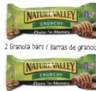
2 Granola bars / Barras de granola