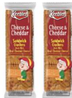
2 Vacuum packed cheese & crackers Galletas con queso embolsada